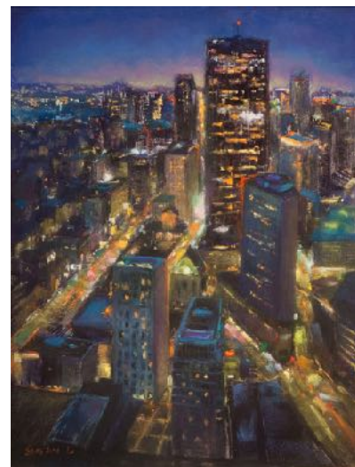
Boston City Lights

5) "Boston City Lights" won Honorable Mention at the BoldBrush online Painting Contest in the Semi-Pro Category.