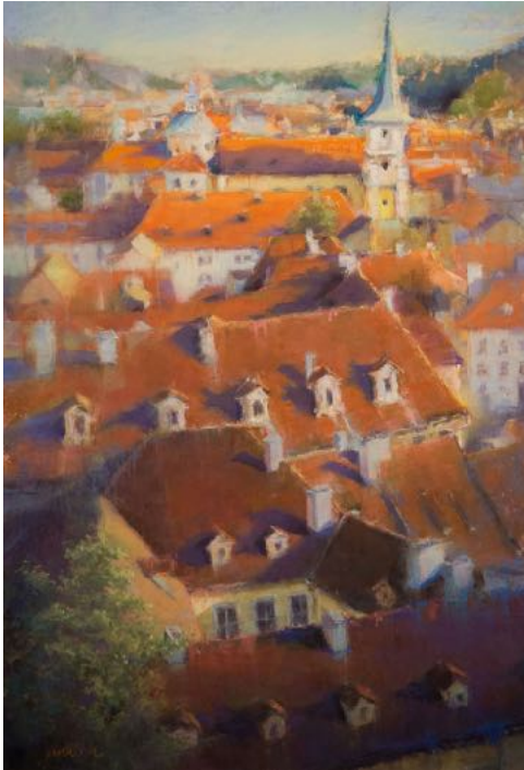
The Maze Of The Rooftops

6) "The Maze Of The Rooftops" won "Outstanding Pastel" award at the online BoldBrush Painting Contest.