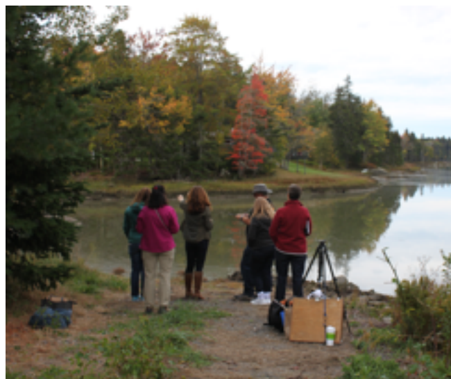
Workshop students plein air painting at the Weskeag Marsh, Photocredit: elaine Hranich