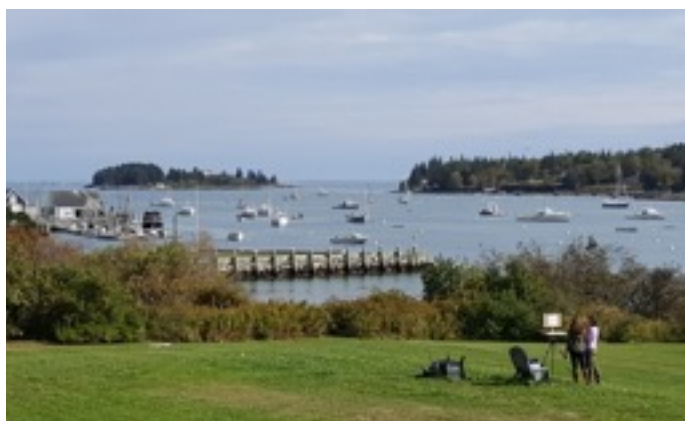
Workshop students painting plein air at The East Wind Inn, Tenants Harbor, ME