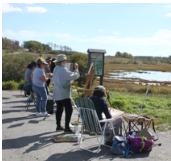
Plein air demo at a cove along Route 73 west of So. Thomaston, ME