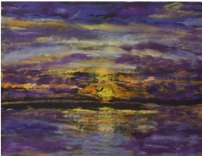
Sunset Over Chincoteague Bay