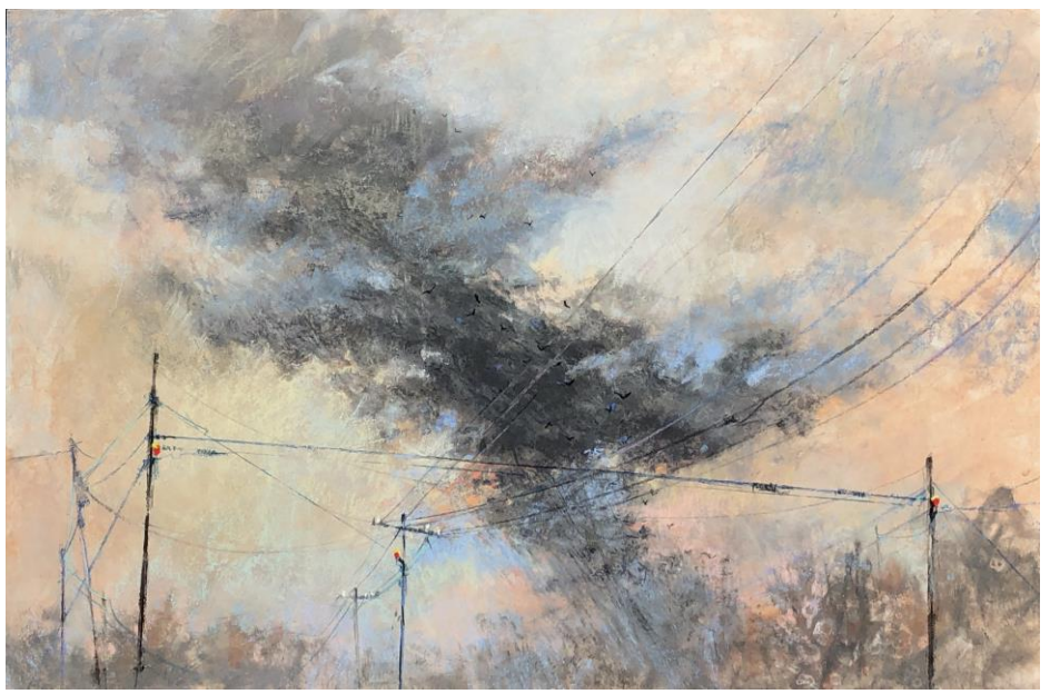
Three On A Match

link: https://www.patreon.com/terrilynn travelingartista