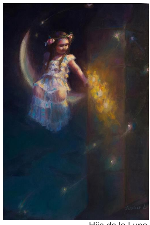
Hija de la Luna

Other accepted juried shows included the International Guild of Realism Fall online show, Salmagundi Club Pastel Showcase, Degas Pastel Society's 19th Biennial National Juried Show, and the upcoming Pastel Society of Eastern Canada's "Pixel Pastel" online Juried Show.