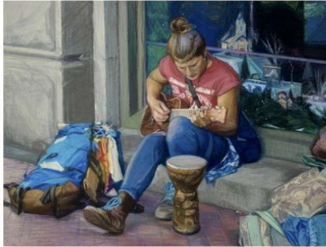
"The Least of These"