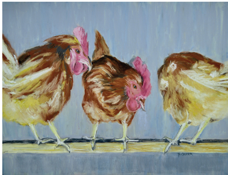
"Abigail Adams, Dolly Madison and Molly Pitcher"

This is the first time I am sending a piece of news to the PSME newsletter! I received an Honorable Mention Award in the Central Massachusetts Pastel Society's Members Only Fall Show for this pastel: