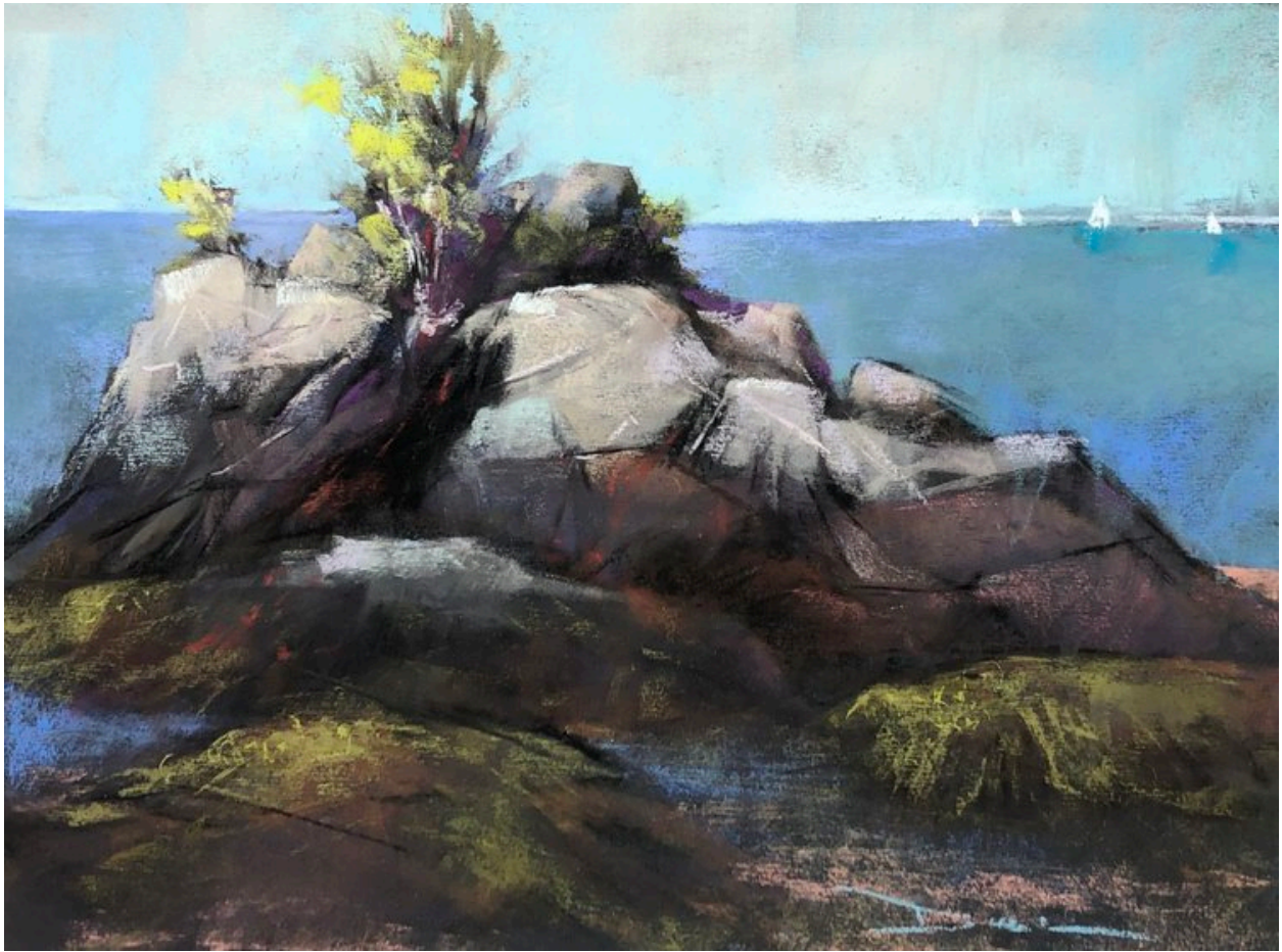
“Audacity” T. Dubreuil (painted during 2021 PSME Retreat)

Annual Spring Retreat 2022 June 8 (Wednesday) - 12 (Sunday) 2022 in Boothbay Harbor, ME. We had a most wonderful time last year and plan to do so again! It is a beautiful location with many choices for views.