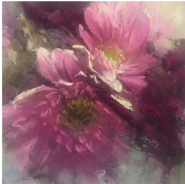
“My Favorite Posy”

This pastel also received the Juror of Selection Award in the “It’s Pastel” National Juried Show at the Pastel Society of New Hampshire, www.pastelsocietynh.com